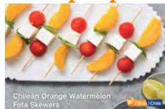
Orange, Watermelon and Feta Skewers