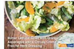
Salad with Citrus Dressing